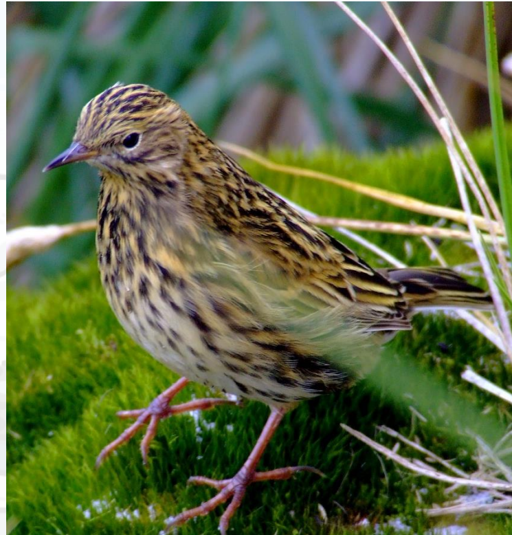
South Georgia pipit