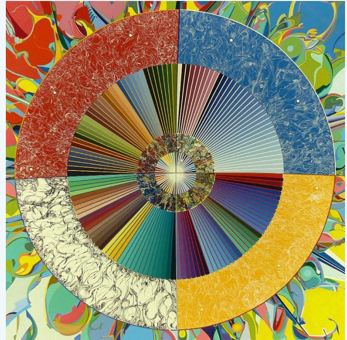
Morning Star, by Alex Janvier, an Indigenous artist of Dene Suline and Saulteaux descent.