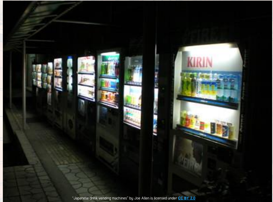
"Japanese drink vending machines" by Joe Allen is licensed under CC BY 2.0

It is said that in Tokyo, you are never further than 12 metres away from a vending machine. In Tokyo, you can buy many different things from vending machines including burgers and clothes!