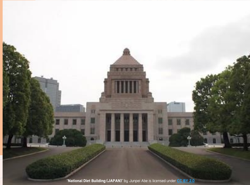
"National Diet Building (JAPAN)" by Junpei Abe is licensed under CC BY 2.0

The Japanese government meet in the National Diet Building in Tokyo.