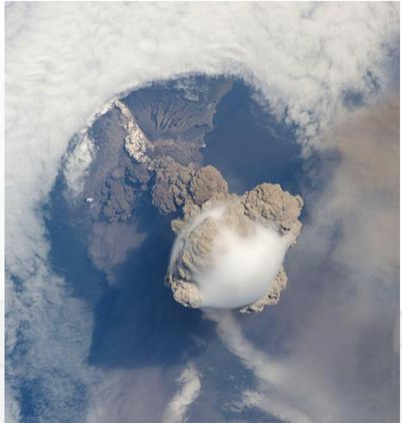
Clouds of hot ash, gas and rock as seen from space.

The gas, ash and rock are known as pyroclastic flows and travel great distances at speeds of up to 100 miles per hour.